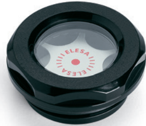
ELESAs Original design

Brass nut type GH. (see page 1372) for fitting to reservoirs with wall thickness smaller than 0.20 (5 mm).